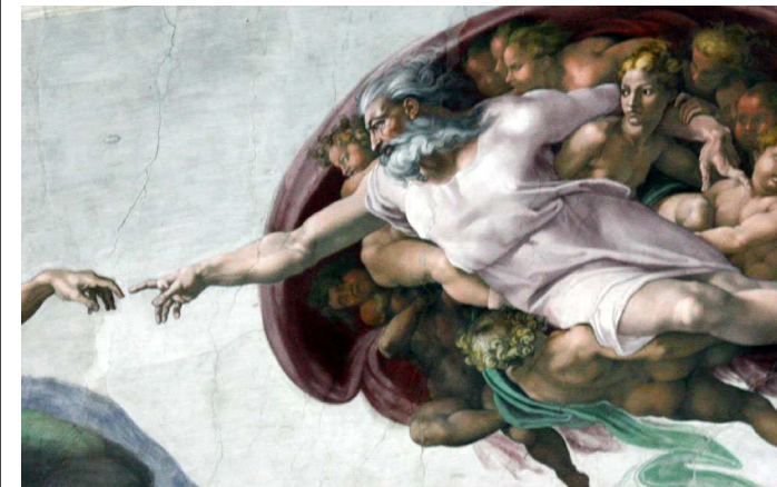
Naughty Michelangelo thought he knew what God looked like ...

You can imagine my surprise when I found that Catholics attack anthropomorphism almost as eagerly as I do myself: ... anthropomorphism is the ascription to the Supreme Being of