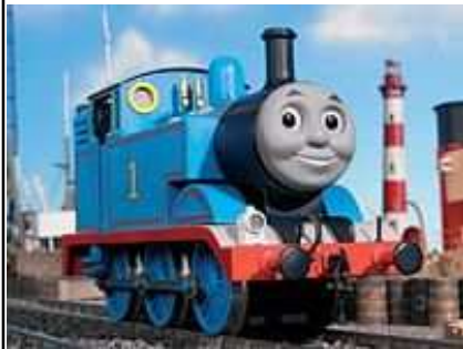
Thomas the Tank Engine