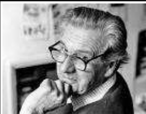
Ludovic Kennedy – a great man and a great secularist