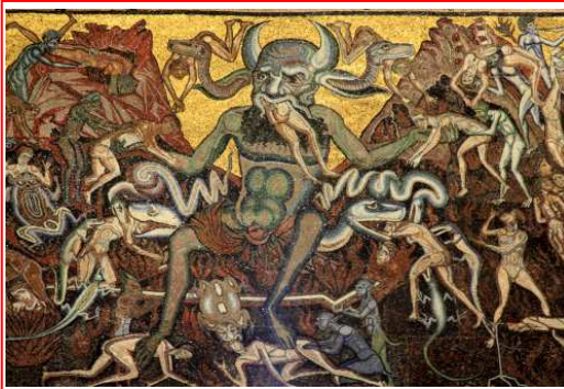
The Catholic Church encourages the faithful to obey its doctrines by telling them what will happen to them if they don't - eternal torment at the hands of Satan. Wonder how many of those in this picture are Catholic priests? (NB Artist's impression only, not a photo)