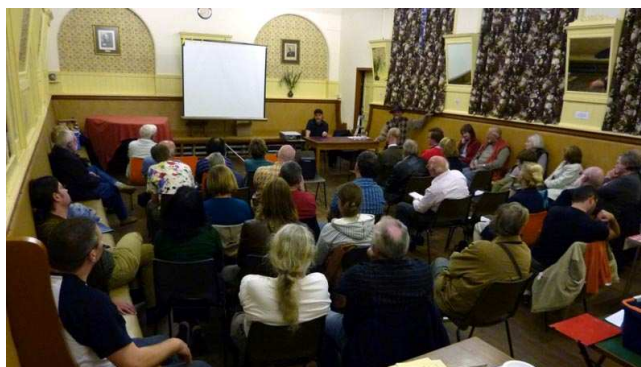
Around fifty attended - a good crowd for the Hall