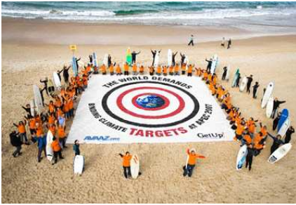
Campaigners in Australia - just one of thousands of events organised through the progressive on-line campaigning body AVAAZ ( http://www.avaaz.org/en/ )